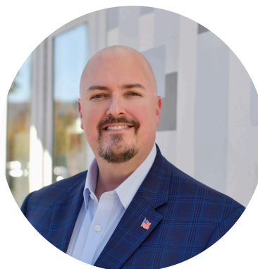
AV EDGE Executive Director

AV EDGE remains committed to leading this work in partnership with our community.