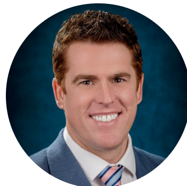
AV EDGE Healthcare Committee Chair

As we present these findings, we do so with a clear understanding that data and conversations alone do not alone drive progress—commitment does. It is our hope that this report serves not only as a resource, but as a call to action for continued investment, innovation, and partnership in strengthening the healthcare system that serves the Antelope Valley.