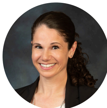
AV EDGE President

We look forward to continuing this work—facilitating collaboration, advancing implementation, and supporting solutions that strengthen both our healthcare system and our regional economy.